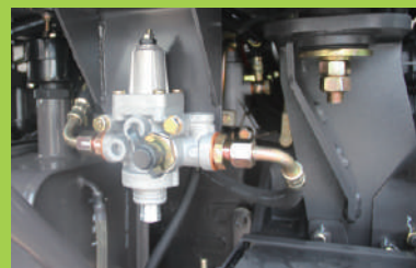
Pressure relief valves